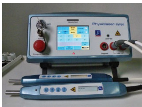
Fig. 3. Physiolaser (2x 90 Watt, 904nm, impulse lasers), Reimers & Janssen, Berlin, Germany